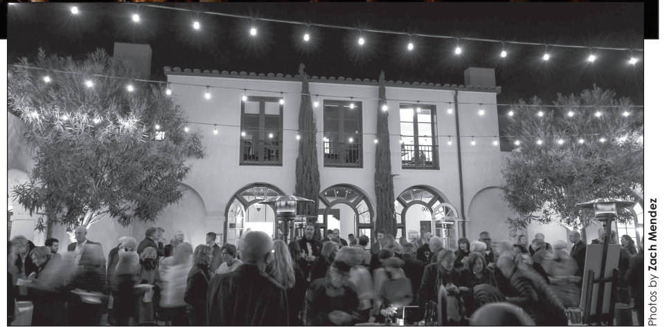
Post-Concert Artists Reception

For encore, a simply beautiful arrangement of Leonard Cohen's Hallelujah . A good time was had by all.